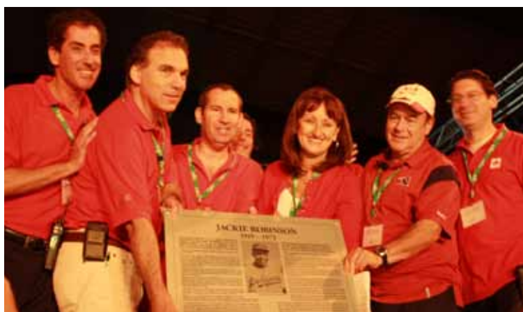
The city honoured Jackie Robinson on its Human Rights Walkway during a ceremony on Canada Day at Pierre Elliott Trudeau Park.

We've even created the first parkette at the corner of Caldwell and Mackle in honour of the centennial of the Donald Berman Maimonides Geriatric Centre.