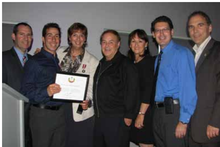
Members of Côte Saint-Luc City Council were on hand as Mayor Anthony Housefather received a Queen's Diamond Jubilee Medal on June 5.