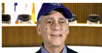
Bernie Green Community Special Events Award