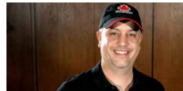
Andrew Winkler Sports Award