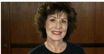
Diane Liebling Hazel Lipes Award