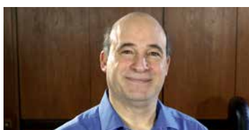
Bryan Wolofsky Community Special Events Award