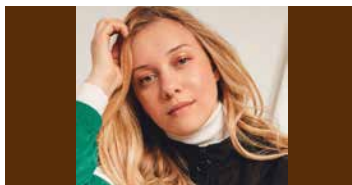
Jeanne Motulsky Special Recognition Award