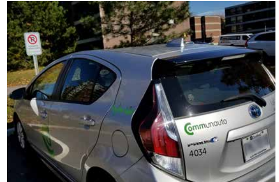
Communauto vehicles are available at the Bernard Lang Civic Centre and the Côte Saint-Luc Shopping Centre.