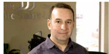
Joel Wener Special Recognition Award